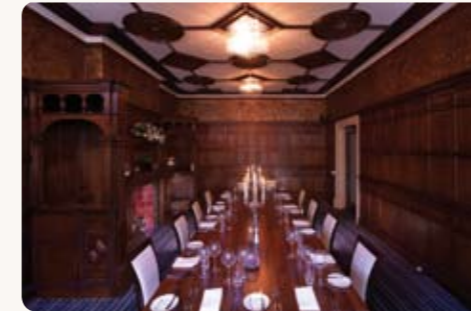
The Oak Room

Incorporating a private bar area overlooking the gardens. Sweeping steps down to the patio making a lovely setting for photographs. The room caters for up to 120 (day) and 200 (evening).