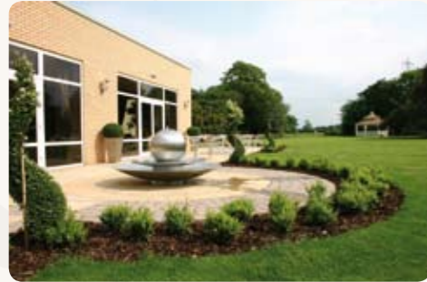
The Torintone Suite

Whether you are planning a lavish wedding reception or an intimate celebration, we have the perfect facilities for you. All our suites are licensed for civil ceremonies including our garden pagoda, so your wedding ceremony can take place in our glorious grounds.