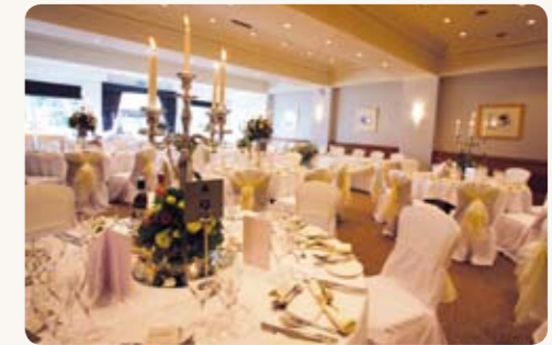
The Pulford Suite

Incorporating a private bar area overlooking the gardens. Sweeping steps down to the patio making a lovely setting for photographs. The room caters for up to 120 (day) and 200 (evening).